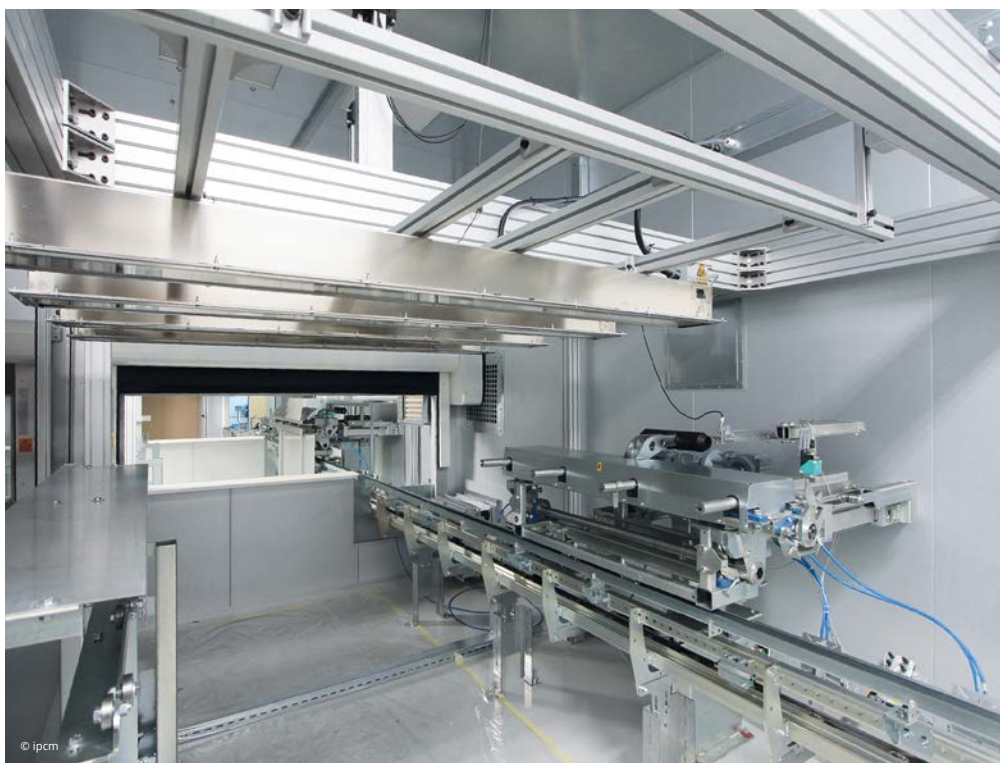
The infrared polymerisation station.