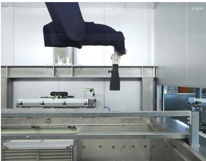
The CO 2 cleaning station.

which is pressurised and has absolute filters for maximum air cleanliness.