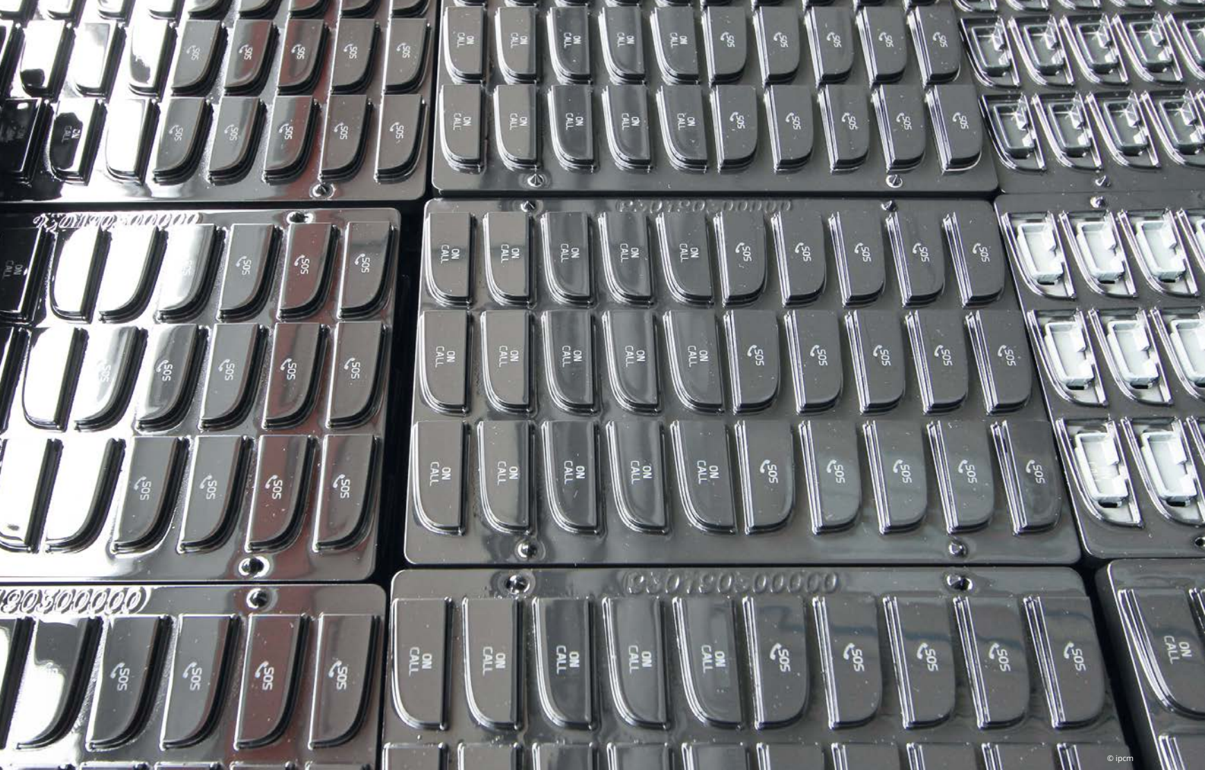
Some keys printed, laser engraved, and coated by Barnem Technologie Plastiche Srl.