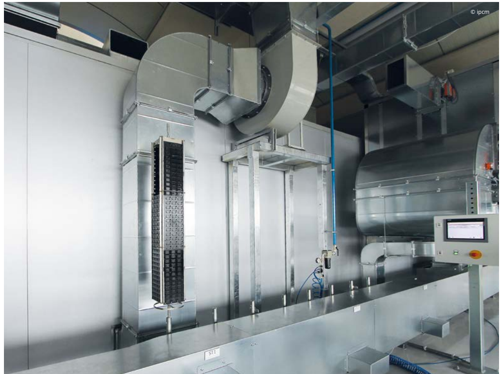
The loading station with a 4-sided loading spindle hooked on a bar.