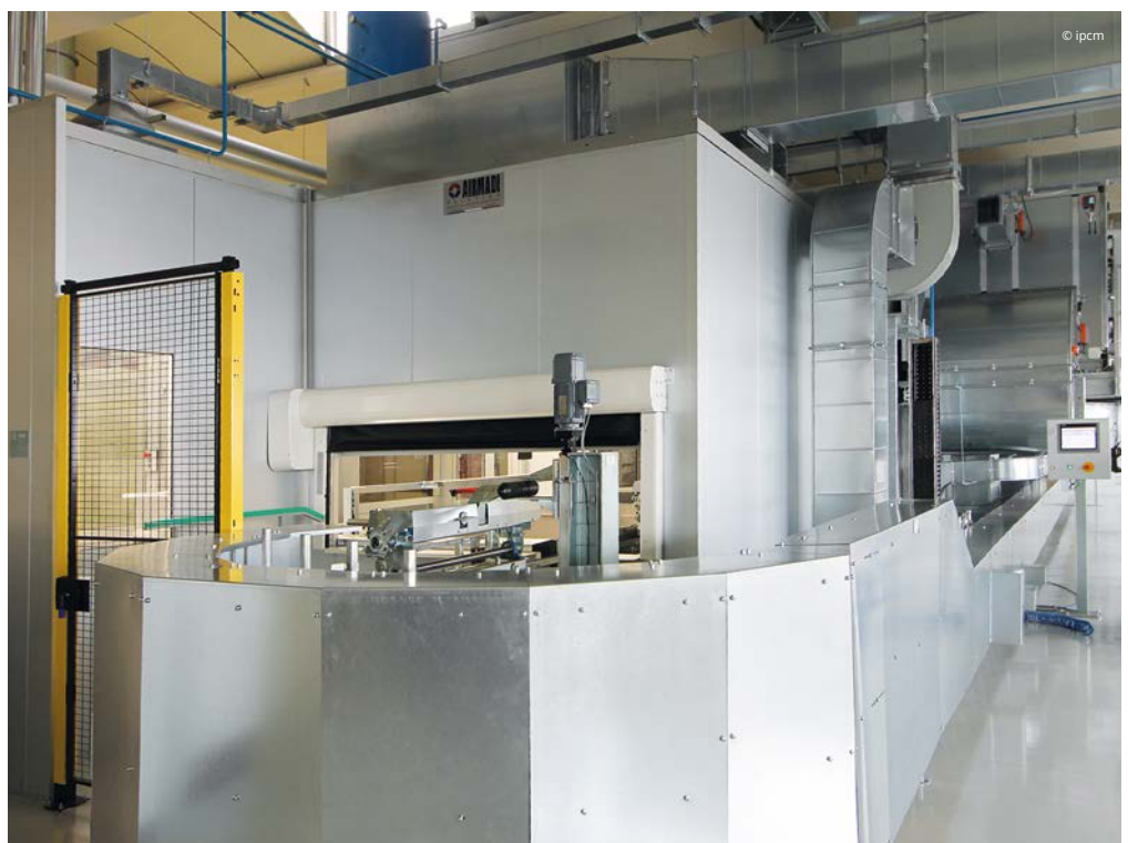
The first station tilts the spindle into a horizontal position to allow guided 360° rotation during treatment.