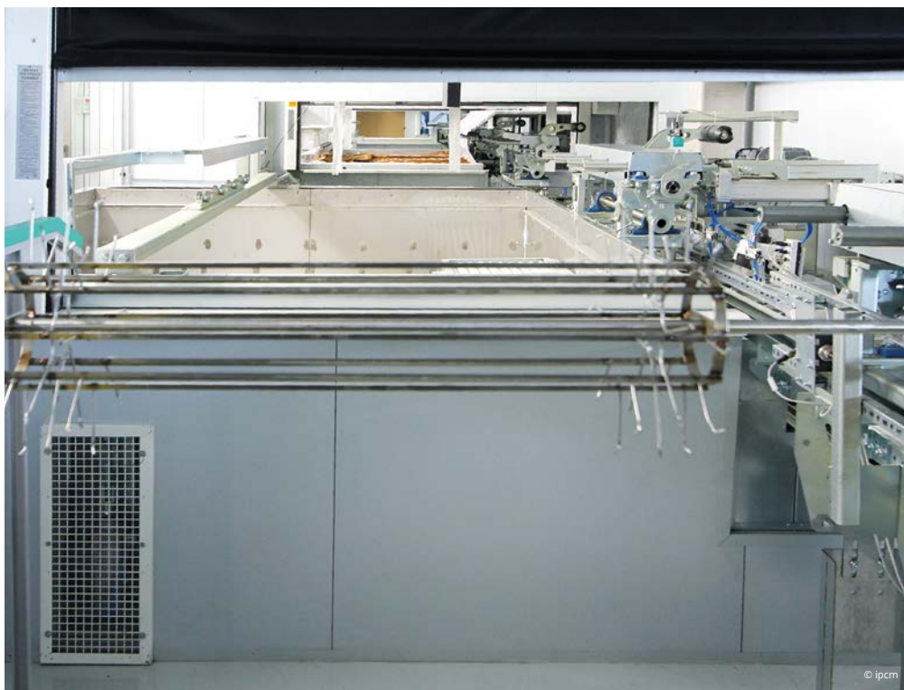
Once in a horizontal position and with only two contact points, the spindle is completely free to rotate independently of the next one.

touch screens with the top layer in plastic instead of glass. The plant we commissioned from Airmadi Painting Srl, together with Railtechniek Van Herwijnen BV for part handling, is in fact devoted solely to applying anti-reflection (AR) coatings and scratch-resistant UV coatings on touch screens and other cosmetic plastic components of the latest generation for car interiors. In particular, we asked these suppliers to design a system using solvent-free UV products with 100 per cent dry residue, in order to make our finishing operations even greener. In addition, we required high flexibility in polymerisation through the integration of the UV lamp station with another station using infrared panels in order to also apply two-component outdoor coatings, which require high resistance to sunlight."