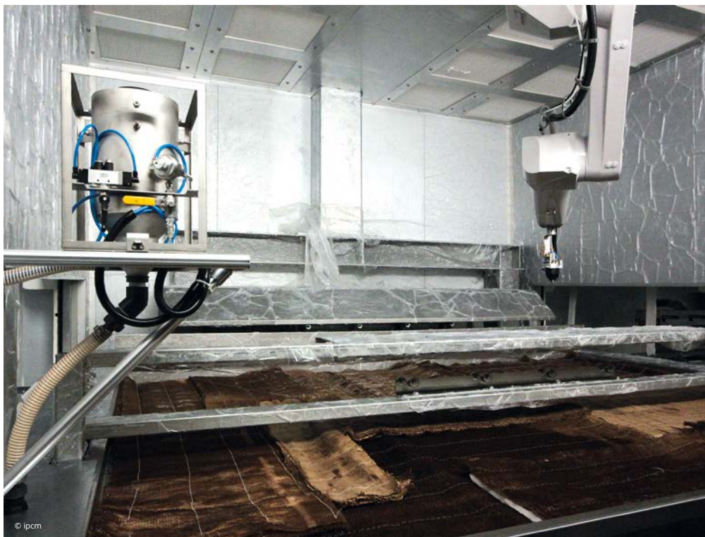
The pressurised, dry-filter paint application booth designed by Airmadi together with the rest of the coating plant.