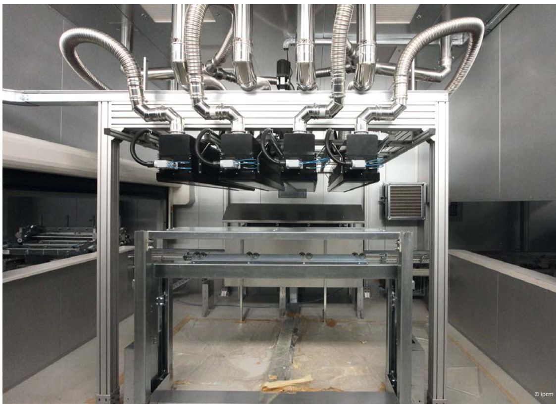
The UV polymerisation station.

Barnem's conveyor because, even though they transport very light workpieces to be coated, the load bars they carry are integrated with the tilting system, reaching a total load weight of 250 kg. Another very important aspect that required a lot of design effort was ensuring maximum precision of the rotation mechanisms and maximum positioning repeatability. This system is therefore very compact, but also highly complex in terms of workpiece handling."