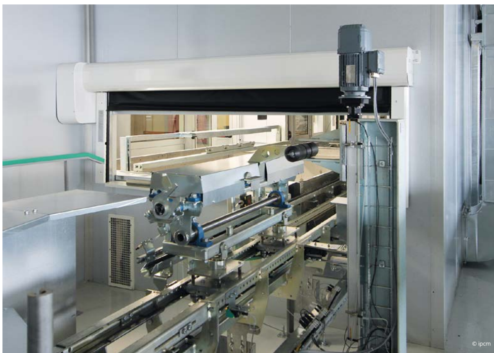
A detail of the tilting system developed by Railtechniek.