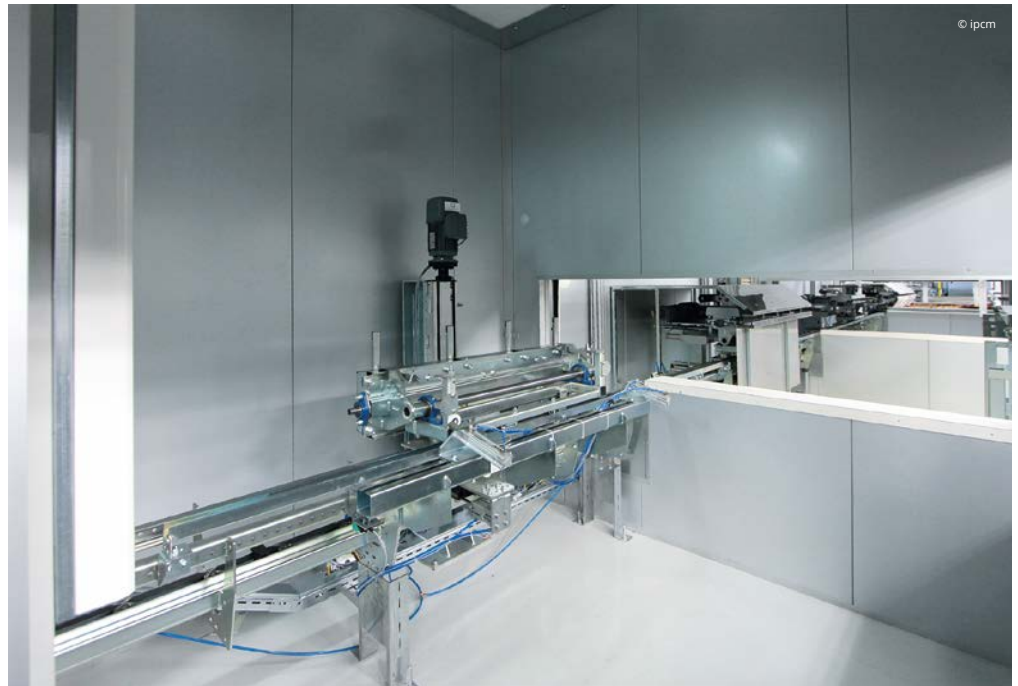
The second tilting station where the spindle is placed vertically before reaching the unloading area.